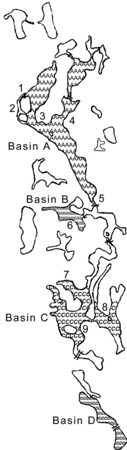
Fig. 1. Map of study wetlands for Chironomidae showing Basins A to D (larval sampling) and location of New Jersey light traps 1 to 9 (adult sampling), Ponte Vedra Beach, Florida, USA.

Technical grade s -methoprene (96% AI) was tested in small rearing units with continuous air supply (Ali & Lord 1980). Larval and/or pupal