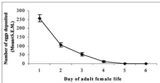
Fig. 3. Mean (± SEM) numbers of eggs deposited per d by individual females of D. flavipennella during their adult life span.