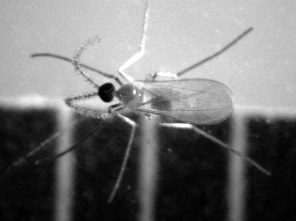
Fig. 2. Adult Feltiella n. sp., a predator of the citrus rust mite Phyllocoptura oleivora reared in the laboratory. The vertical bars beneath the insect are in millimeters.

were usually eaten when grasped on any part of their bodies.