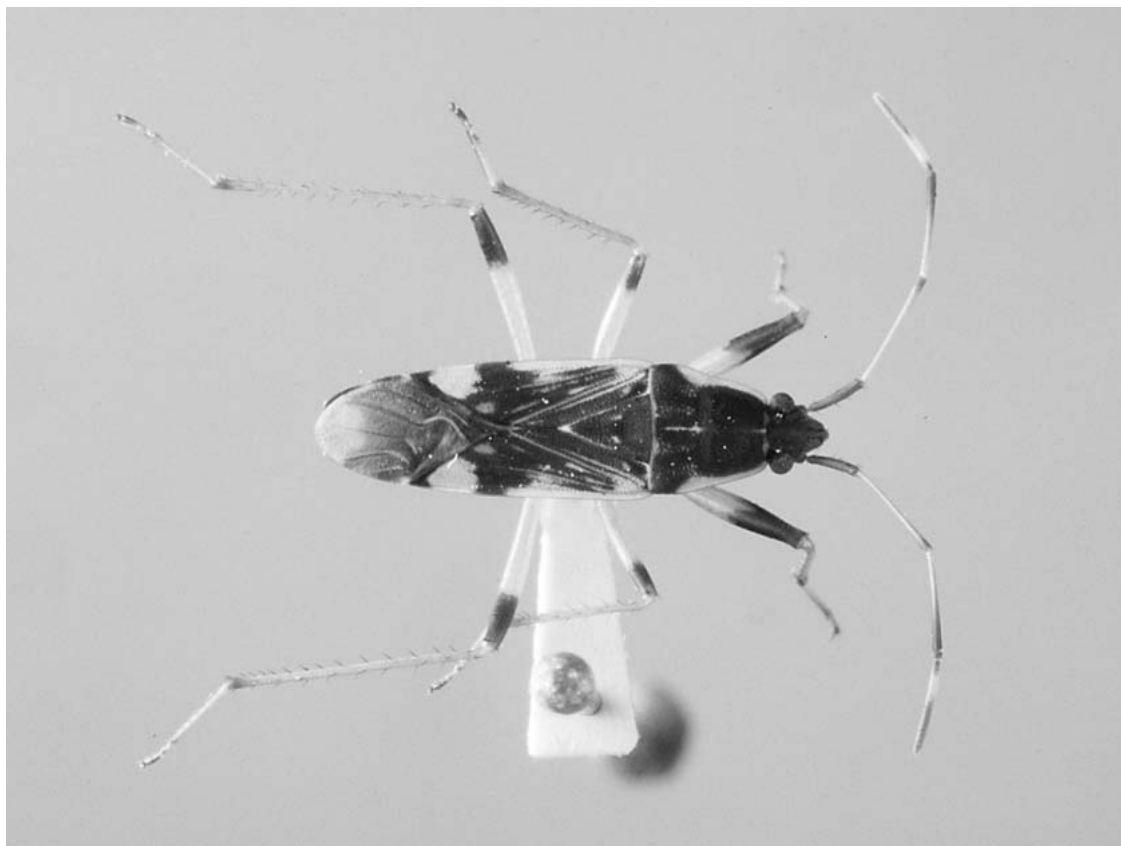
Fig. 1. Dorsal view of an adult Dieuches armatipes (Walker).

seeds was not reported; it also has been collected under stones and along the roadside at 1,200 meters above sea level in mixed grasses and herbs (Eyles 1973). This species reportedly feeds on harvested peanuts, a legume introduced from South America into Africa in the 16th century (Hill 1975). In Grand Cayman, West Indies, D. armatipes has been collected under coastal plants (R. M. Baranowski 2003, pers. comm.).