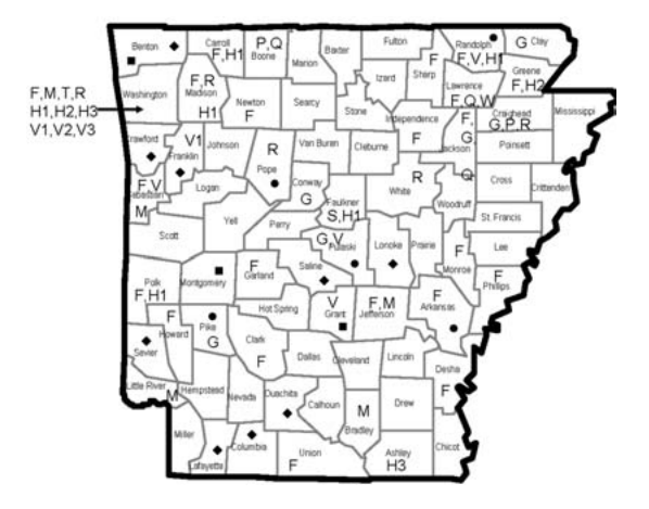
Fig. 1. Species distribution of Reticulitermes haplotypes in Arkansas. Samples obtained from the National Termite Survey, but not subjected to genetic analysis are marked as " \clubsuit " R. flavipes , " \clubsuit " R. virginicus , " \blacksquare " R. hageni . Letters indicating haplotypes are given in Table 1.

apparent consistency of haplotype occurrence for Reticulitermes spp. in this study based on geography. However, we found genetic divergence values similar to those detected in our previous works (Austin et al. 2004a, b).