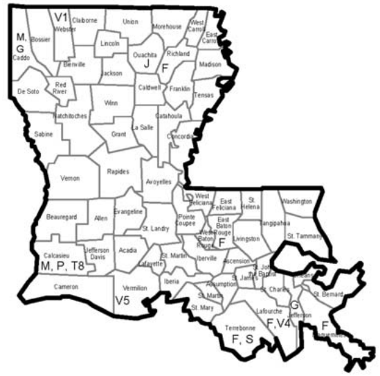
Fig. 2. Species distribution of Reticulitermes haplotypes in Louisiana. Letters indicating haplotypes are given in Table 1.

A haplotype or allele is defined by one unique form of the gene and differs from any other haplo-