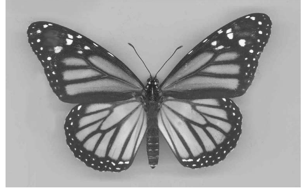
Fig 2. A. The "J" stage and chrysalis of the larvae with three tubercle pairs (note the small third tubercle remnant). B. Adult morphology of one of the 11 aberrant individuals, which was visually indistinguishable from the 'normal' type of individual reared from the same site.