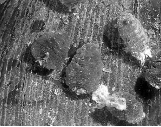
Fig. 2. Palmicultor lumpurensis adults on bamboo.

economic impact of these invasive species for Florida's bamboo is not yet known. Monitoring of populations from each of these invasive species