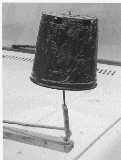
Fig. 1. The “trolling” deerfly trap: A. truck-mounted apparatus used in experimentation, B. cup version mounted on cap for personal protection and C. individual trap that can be mounted on a lawnmower, 4-wheeler or other vehicle to suppress deer flies from dooryards and other locations.

traps of each color were used and the pots of the 3 colors were grouped in two sets to begin the first replicate then randomized as described above.