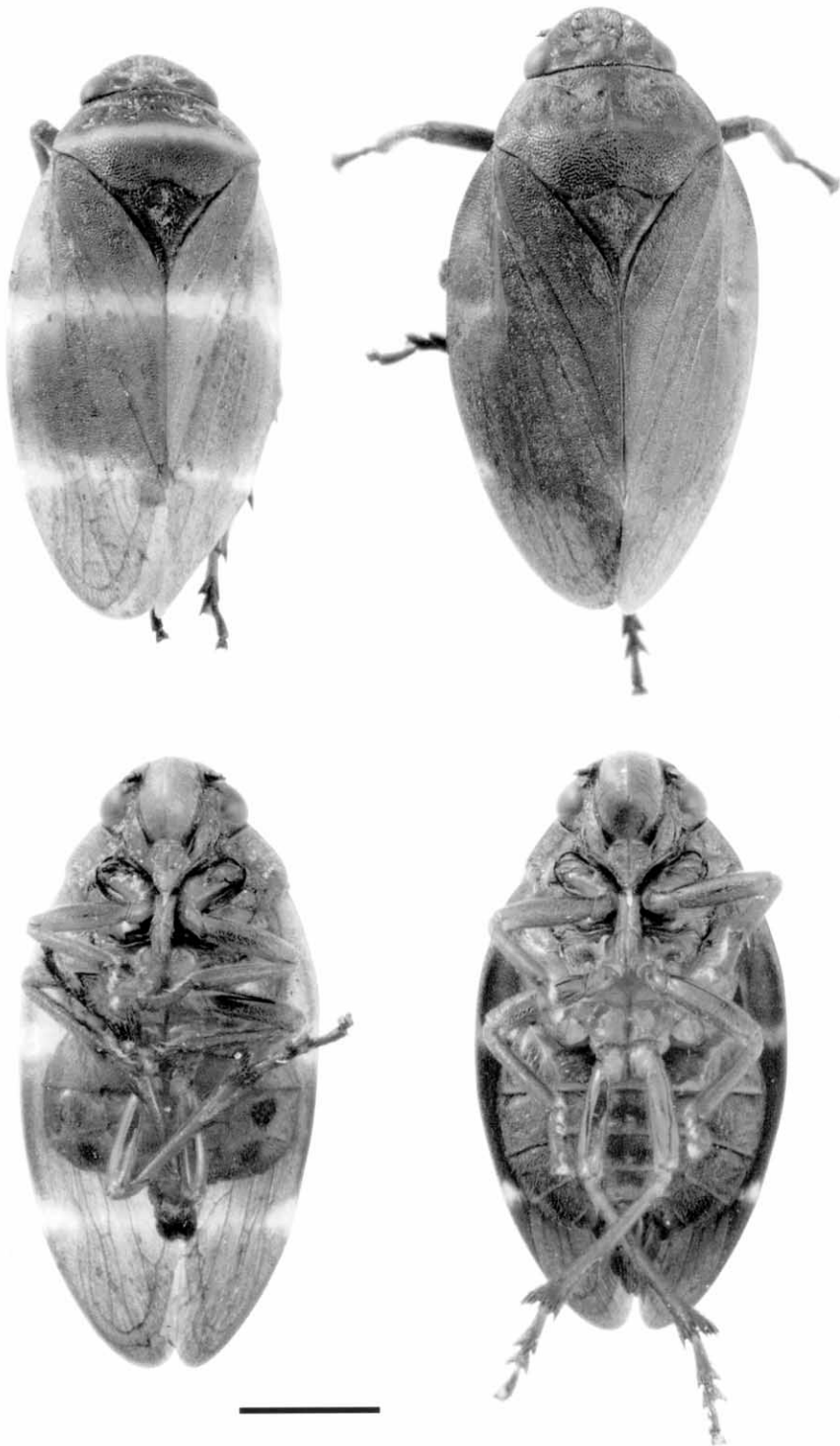
Fig. 2. Prosapia simulans showing most common color patterns (dorsal and ventral) of males (left) and females from newly detected populations in Cauca Valley, Colombia. Bar = 2 mm.