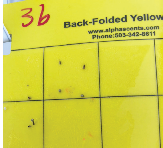
Fig. 2. Yellow sticky card containing pushpins marking the location of captured parasitoid wasps. Pushpins were placed approximately 2 to 3 mm from each captured wasp and their movement on the sticky card can be observed with the wasp’s varying distance from pushpins.

A statistical analysis comparing the 2 types of yellow sticky cards is not provided because the goal of this study was not to thoroughly compare retention or captures between sticky card types. Data was collected on 3 species and found retention varied by species; therefore, it is