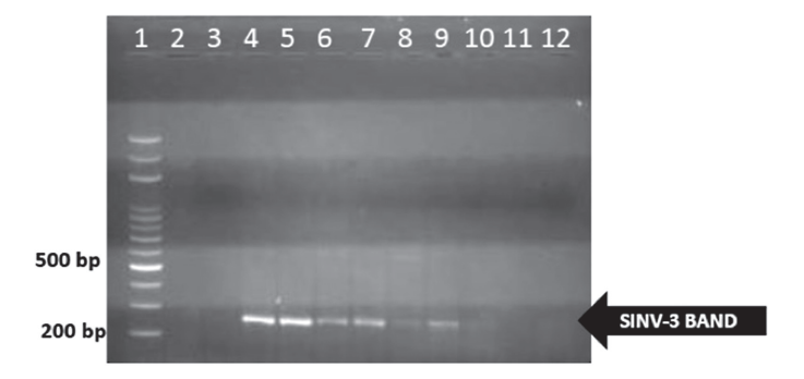
Fig. 2. Representative agarose gel depicting detection of Solenopsis invicta virus 3 as determined by polymerase chain reaction using cDNA generated from RNA purified from female alates of Solenopsis invicta . Arrow represents the 258 bp amplicon from Solenopsis invicta virus 3. Lane 1 is a 1 kb DNA ladder and lane 12 is non-template control.

S. invicta colonies in cities that have high infection rates versus those that had no infection rate. One could also examine the health of S. invicta colonies in cities without the virus such as Jay, Pensacola, or Jacksonville, and then introduce the virus to those cities. One could then compare the before and after health changes of colonies in the field afflicted by Solenopsis invicta virus 3. The introductions could follow protocols used by studies that introduced the virus to Gainesville (Valles et al. 2009) and California (Oi et al. 2019).