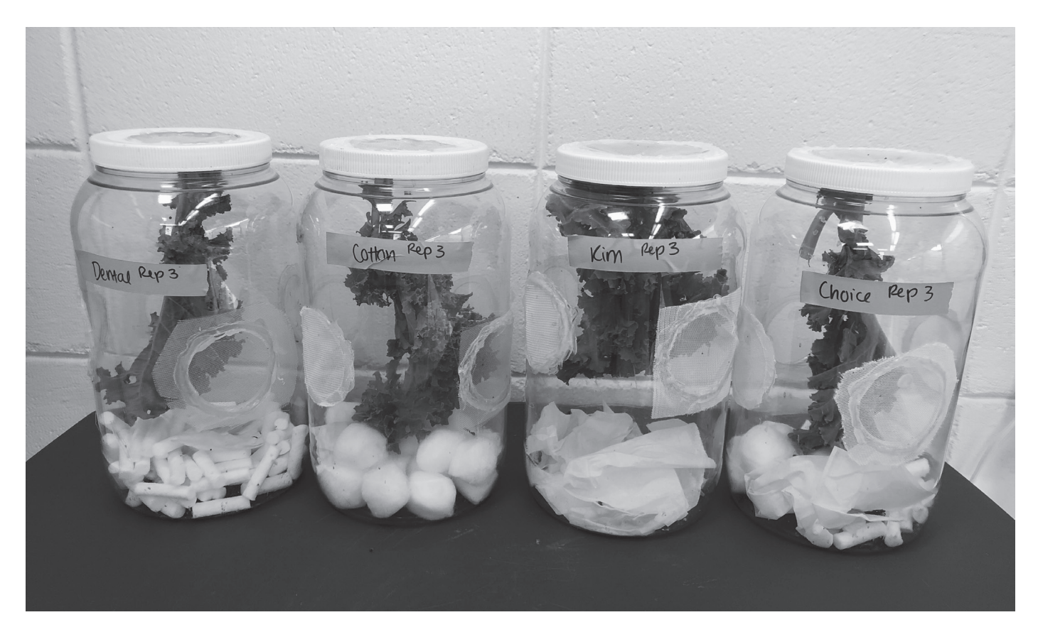
Fig. 1. Large cages for no-choice and choice tests for evaluating the preference of Bagrada hilaris for 3 artificial oviposition substrates: dental wicks, cotton balls, or Kimwipes.

There is a risk that Bagrada hilaris will be transported from the southwestern USA and establish in Florida where it could infest Brassi -