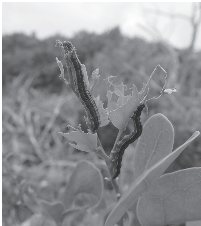
Fig. 17. Melipotis januaris larvae on Pithecellobium keyense .