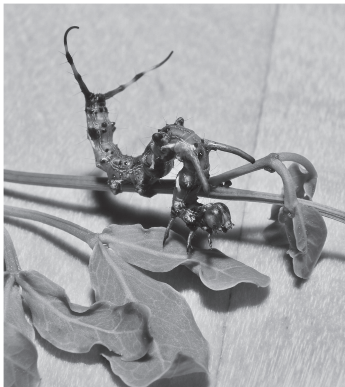
Fig. 18. Tyrissa multilinea larva on Pithecellobium keyense .

do not exactly match any described species that is illustrated in its original description, but the maculation resembles Crociosema cayeya Razowski and Becker (Lepidoptera: Tortricidae) and other Antillean species. Several species of Crociosema have been described in recent yr, some only on the basis of less variable female specimens. We hesitate to provide a formal description until more specimens of it and congeners can be obtained from the Caribbean region. No specimens were caught in the Malaise trap at the site despite biweekly trap servicing.