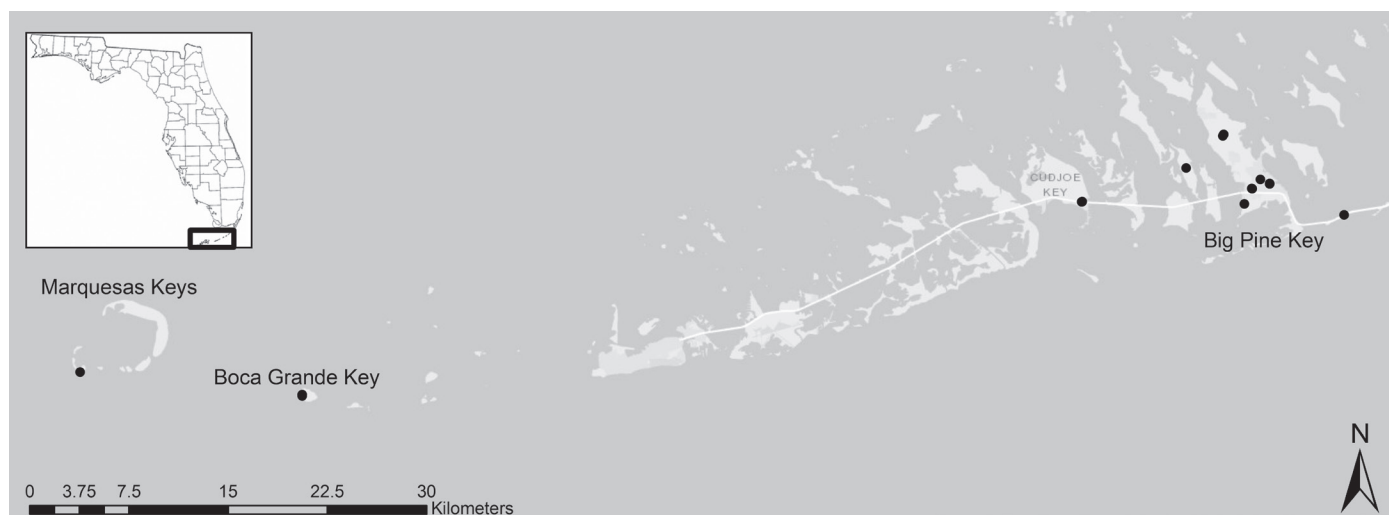
Fig. 16. Map of collection sites.

The first specimen of this undetermined species was a male reared on nickerbean foliage brought to Gainesville. Based on the male, J. Baixeras (Universitat de València personal communication) remarked that it seems to represent an undescribed species. The Division of Plant Industry team subsequently found larvae rolling leaves at a vacant lot on Palmetto Avenue on Big Pine Key. One female emerged from that lot (Fig. 8); the other larvae perished during the return to Gainesville. It should be easy to rear locally. Crociosema Zeller species (Lepidoptera: Tortricidae) feed on various plant families, and Crociosema aporema (Walsingham) (Lepidoptera: Tortricidae) is a major pest of legumes. The male genitalia, although similar to those of C. aporema , more closely resemble Epilotia arctostaphylana (Kearfott) (Lepidoptera: Tortricidae), a Western species (Heinrich 1923), but the new species has androconia typical of Crociosema . The male has hair pencils on the dorsal base of the forewing that probably fit underneath tufts on the abdominal pleura. We could not find any conspecific specimens in the Florida State Collection of Arthropods or McGuire Center for Lepidoptera and Biodiversity collections, including material recently collected in the Bahamas by J.Y. Miller and D. Matthews. The male and female