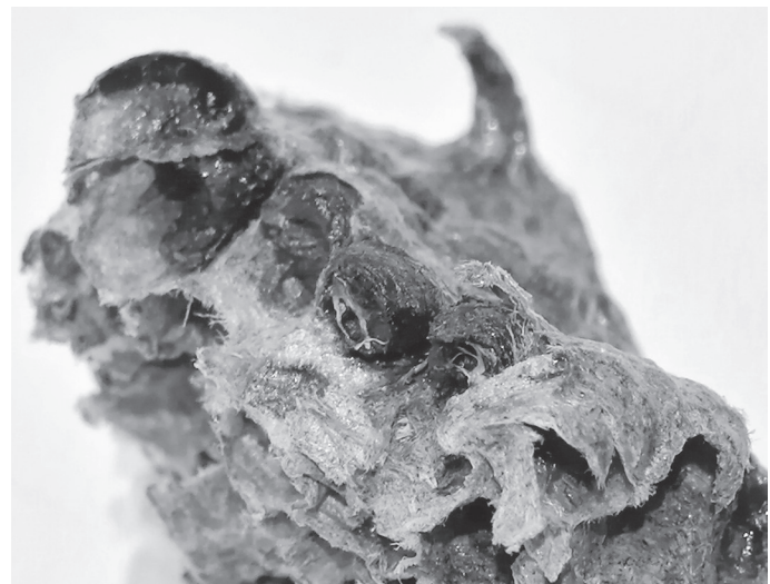
Fig. 1. Meconia in the bottom of the cells of a Polistes dominulus nest.

Nutrition plays a major role in caste determination in many social insects (Hunt et al. 2003). Different castes have different metabolic and nutritional requirements (Judd & Fasnacht 2017). Therefore, the composition and dry weight of meconium are indices of food consumption and energy balance within the colony (Marian et al. 1982). In our study,