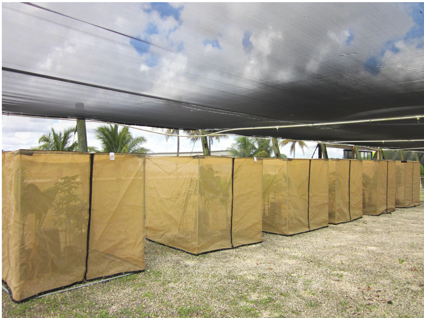
Fig. 1. Photo showing the cage arrangement. Six cages ( 1.83 \times 1.83 \times 1.83 m with 20 \times 20 Mesh Lumite) were constructed in a shadehouse in a north-south row. Each cage had 5 potential host plants and a source plant containing adult whiteflies.

ing a stream of air over them using a disposable plastic pipette, and the leaves were examined under a dissecting microscope to count the total number of eggs. The cumulative number of eggs for each target plant species was determined. The number of spirals per plant and the number of eggs in each spiral was recorded and calculated for both the source plant (bird of paradise) and the target host plants.