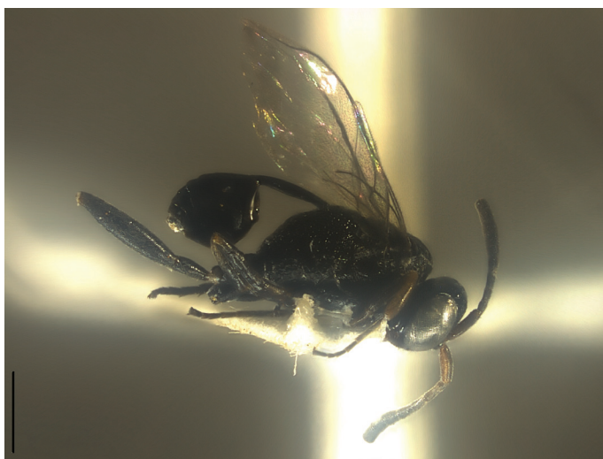
Fig. 2. Semaeomyia sp. (Hymenoptera: Evaniidae). Scale bar: 500 \mu m.

This study reports possible parasitism of the spider Teudis sp. Pickard-Cambridge (Araneae: Anyphaenidae) by the parasitoid Semaeomyia sp. Bradley (Hymenoptera: Evaniidae) as a parasitoid. In Oct 2016,