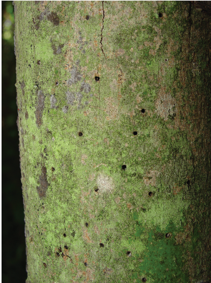
Fig. 1. Ambrosia beetle gallery entrances in the trunk of a Lysiloma latisiliquum . Euwallacea nr. forficatus and Theoborus ricini were the two most abundant species of ambrosia beetle recovered from L. latisiliquum .

is not known how different Fusarium species affect host selection and colonization by E. nr. forficatus .