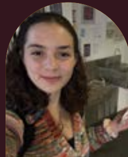
EDITORIAL TEAM VERONICA KERR