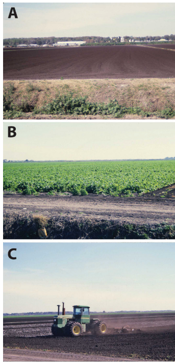
Figure 3. Pictures of Zellwood Muck farm located just north of Lake Apopka around 1987.

Early soil scientists were only interested in wet organic soils for their agricultural potential. Reclamation simply involved draining the water so that normal agricultural methods could be used to farm. If not drained, such water-covered lands were deemed worthless. Over time, however, as people began to understand the importance of wetlands, society began to recognize wetlands as valuable natural resources. By the end of the 20th century, American soil scientists, after examining soil profiles from sites all over the continental United States, had developed a comprehensive soil classification system (Evelt and Cheng 2007).