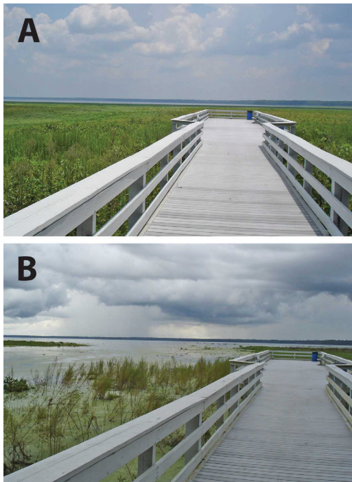
Figure 7. Photo of Lake Newnan taken during drought conditions (a, May 31, 2012) and after 6 + inch rainfall (b, August 22, 2012).

Mother Nature and time can also redistribute muck in shallow Florida systems when water levels rise after droughts. If a lake's water level is lowered sufficiently for plants to root but not to the point where the muck dries out, aquatic and terrestrial plants may root in the muck. Given sufficient time for the root systems to develop, floating islands (tussocks) will form when the water level rises. Wind can then push the islands over great distances. When that happens, muck can be deposited at locations far from where it was formed when the tussock settles or disintegrates. If the water rises sufficiently to flood the land beyond the shoreline, tussocks can float landward of the traditional shoreline. If these tussocks originated in shallow, nearshore waters, a sandy bottom will be seen when the water returns to its normal stage. This is another reason why some professionals do not recommend maintaining stable lake water levels. The primary question is how long people will wait for Mother Nature and time to do their thing!