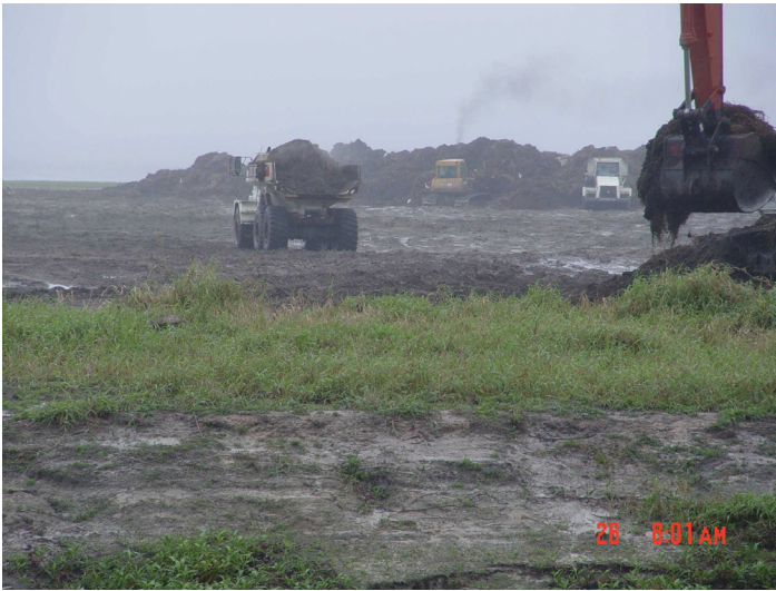
Figure 6. Heavy equipment moving muck during a lake restoration program for Lake Tohopekaliga, Osceola County, Florida.

When an aquatic plant management program is implemented or a water body undergoes substantial nutrient enrichment, the most frequent question asked by the concerned citizen is “how much muck do the aquatic plants produce?” A definitive answer is difficult to provide because so many environmental factors determine muck accumulation rates, but generally, algae produce the least muck, submerged macrophytes produce a little more than algae, and emergent, floating-leaf, and floating plants produce the most muck.