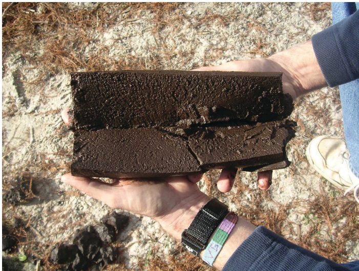
Figure 2. Mark Brenner holds a short section of a lake sediment core that was sliced lengthwise to reveal the consistency of deeper, consolidated, organic-rich mud deposits. The core was collected from Lake Lochloosa, north-central Florida.

Muck, to the non-scientist, is nothing more than the black or brown ooze on the bottom of lakes. The scientific community, on the other hand, distinguishes among various types of muck, depending on their origin and composition. One common characteristic, however, is the presence of a large amount (typically 20% to >80%) of organic matter.