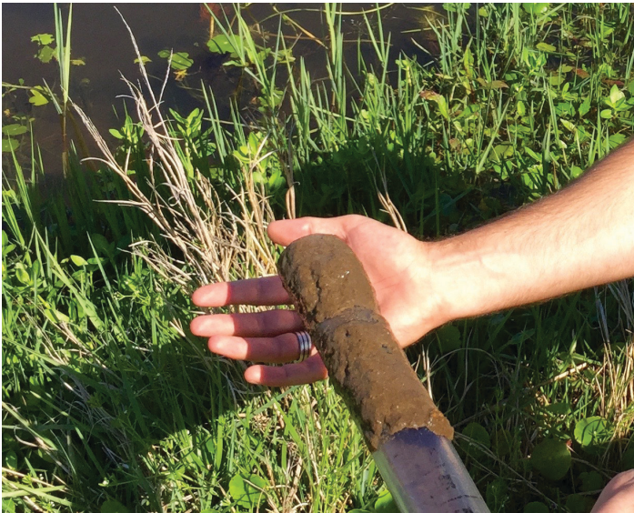
Muck from pond at Fisheries and Aquatic Sciences, Gainesville, FL.