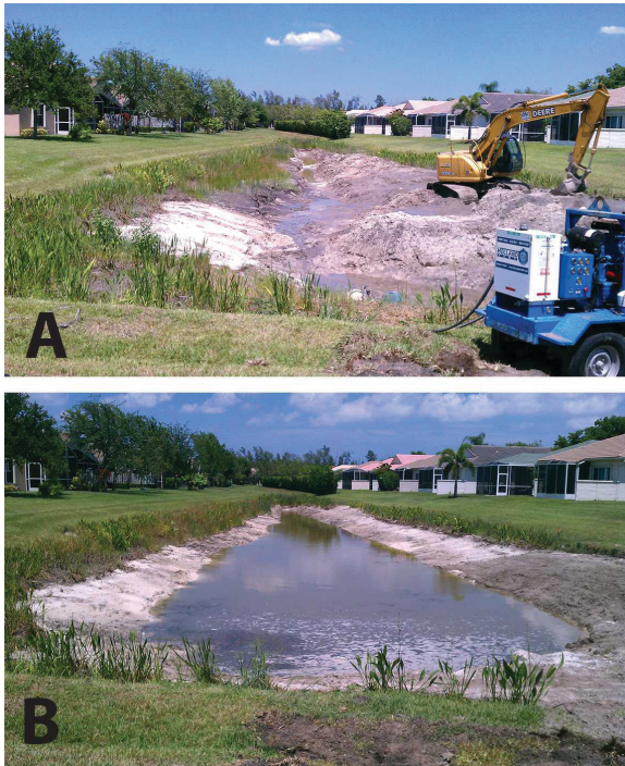
Figure 9. Picture of retention pond in Boynton Beach, Florida, before (a) and after (b) a small-scale dredging operations.

For some situations, smaller hydraulic dredgers can be employed. Sediment disposal is often accomplished by placing muck into an on-land container called a geotube. A geotube container is a specially designed geotextile fabric for dewatering dredge slurries. The geotube retains the sediment but allows water to exit and return to the system. Sediments are held within the bag until dry (often weeks to months) and then removed by truck. Geotubes are expen-