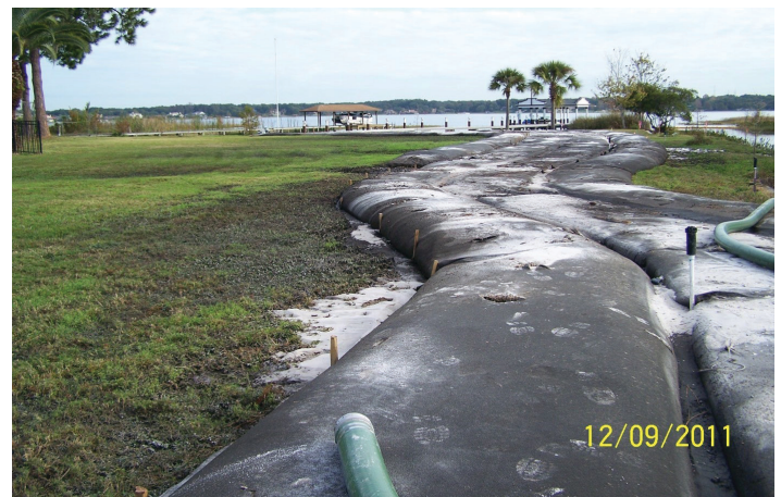
Figure 8. Large-scale muck removal using geofilter tube to dewater muck from Lake Down, FL.

The sediment slurry, once pumped into the settling basin, is allowed to settle, and the water, once cleaned of sediments to meet water quality standards, can often be returned to an aquatic system, unless it has been totally evaporated. Lack of land or the high cost of land in an urban area can preclude the use of large-scale suction dredging. If the water level in a water body can be lowered sufficiently to allow nearshore bottom sediments to dry, bottom muck can be scraped down to hard bottom using conventional