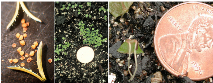
Figure 5. Capsule with seeds (left), seedlings (center), and rooted leaf fragment (right) of East Indian hygrophylla.

Small fragments and sections of leaves will readily produce roots and form new plants (Peters 2001). It is likely that the plant's spread and colonization of new areas occur mostly through vegetative means because the stems of East Indian hygrophylla are somewhat fragile and easily break into fragments.