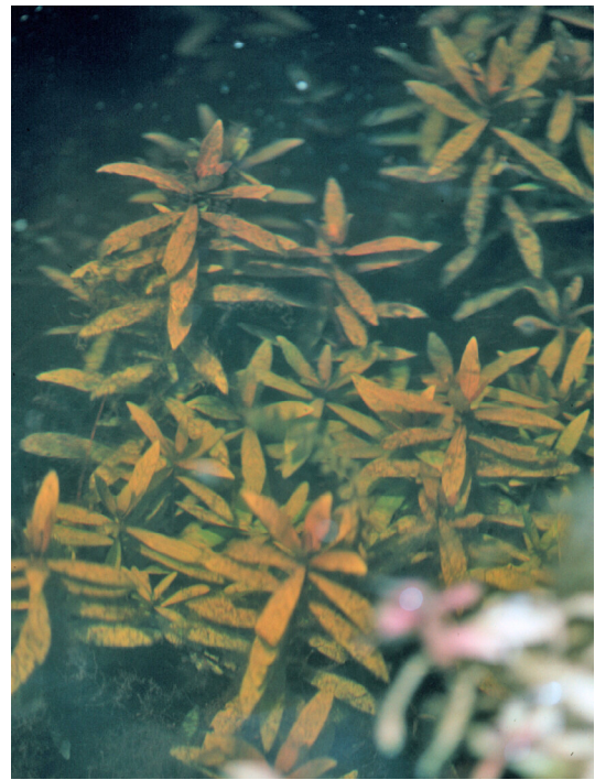
Figure 3. Submersed growth of East Indian hygrophila.

The species is most commonly found growing under submersed conditions with the uppermost part of the plant emerging above the water, but plants can also grow along shorelines and other areas with wet soil. It prefers to grow in areas of moving water such as streams and canals, but it also grows in still waters where little flow occurs.