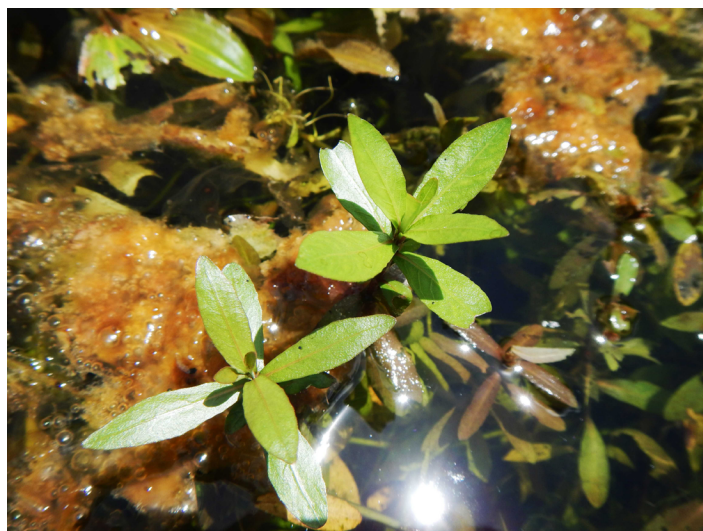
Figure 1. Emergent growth of East Indian hygrophila.

East Indian hygrophila, also known as Miramar weed, Indian swampweed, and hygro, is an invasive aquatic plant that grows under submersed and emergent conditions. The species' center of origin is unclear, but it is thought to be native to the East Indies, India, Malaysia, and Taiwan (UF IFAS CAIP 2015). Although many species of Hygrophila are found throughout the world, only the introduced species H. polysperma and H. corymbosa as well as the native H. costata are found in Florida. East Indian hygrophila is classified by the USDA as an obligate wetland plant, meaning it almost always occurs in flooded or wetland habitats as opposed to more terrestrial environments (USDA NRCS 2015). The species is a federally listed noxious weed (USDA NRCS 2015) and a Florida Class II prohibited aquatic plant (FDACS DPI 2015). Class II Prohibited Aquatic Plants may be grown by registered nurseries but shipped only to customers outside of Florida. However, East Indian hygrophila's status as a federal noxious weed means that nurseries must also obtain a federal permit for interstate movement and a state permit for culture of the species. Accordingly, the UF/IFAS Assessment of Non-Native Plants in Florida's Natural Areas lists East Indian hygrophila as a prohibited plant (UF/IFAS Assessment 2016).