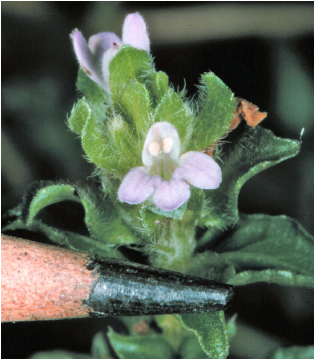
Figure 4. Flower of East Indian hygrophylla.

Small fragments and sections of leaves will readily produce roots and form new plants (Peters 2001). It is likely that the plant's spread and colonization of new areas occur mostly through vegetative means because the stems of East Indian hygrophylla are somewhat fragile and easily break into fragments.