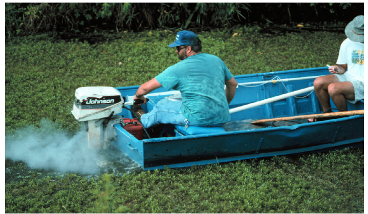
Figure 6. An attempt to operate an outboard motor in dense, topped-out East Indian hygrophylla.

single species) that are poor habitats for aquatic fauna, most of which require a diverse environment in order to thrive. Dense plant growth can also trap heat. This raises the temperature of surface water and depletes dissolved oxygen in the shaded lower portion of the water column, resulting in conditions that negatively impact fish. Robust populations of East Indian hygrophylla can obstruct water flow in flood-control canals, which can have serious consequences if resource managers need to quickly move large volumes of water to prevent flooding during tropical storms, hurricanes, and other severe weather events. Large mats of fragments may also collect at culverts and interfere with water control pump stations. Recreational uses of infested waters are limited as well. For example, boat motors quickly become clogged with weeds, and fishing lines can snag shortly after being cast.