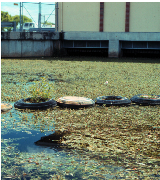
Figure 7. East Indian hygrophylla near a water control structure.

owners remain unaware of the ecological consequences associated with the release of introduced species into public waters. Although intentional release was most likely the vector for initial introductions of East Indian hygrophylla, accidental transfer of this and other submersed species frequently occurs when boats, trailers, and other equipment are moved from an invaded site to an uninfested one. Therefore, anything that has been used in waters where East Indian hygrophylla is present should be carefully inspected before being moved to another aquatic system. Any plant fragments must be removed to prevent the introduction of this noxious weed to uninfested bodies of water (Gettys et al. 2013).