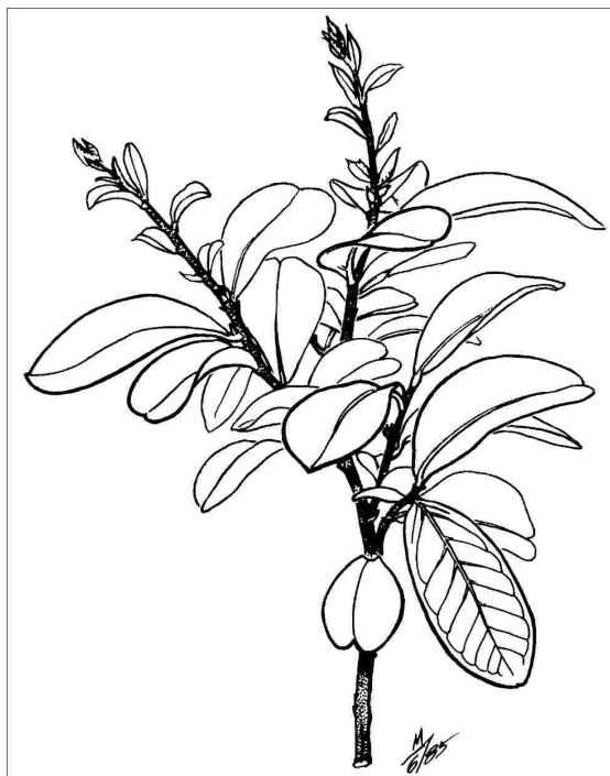
Figure 3. Foliage

Verticillium wilt susceptibility: resistant Pest resistance: resistant to pests/diseases