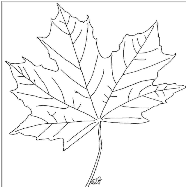
Figure 3. Foliage

Pest resistance: resistant to pests/diseases