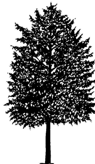
Figure 1. Middle-aged Acer platanoides 'Olmsted': 'Olmsted' Norway Maple