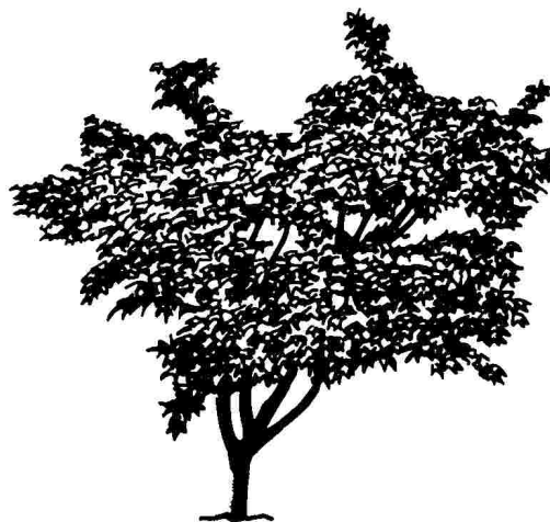
Figure 1. Young Acer palmatum 'Ornatum': 'Ornatum' Japanese Maple

USDA hardiness zones: 5B through 8B (Fig. 2)