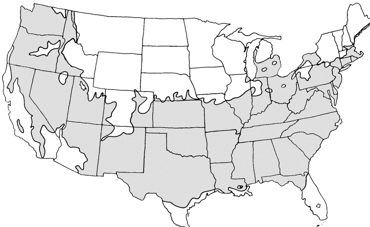
Figure 2. Range