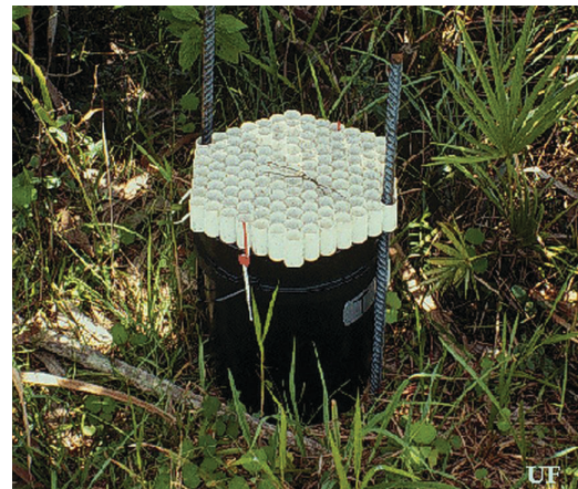
Figure 15. Bucket trap used to capture palmetto weevil adults.

In January 2010, the federal government prohibited the importation into the United States of live palms belonging to 17 genera, since it is suspected that the weevils are spread with imported palms (Turnbow and Thomas 2008).