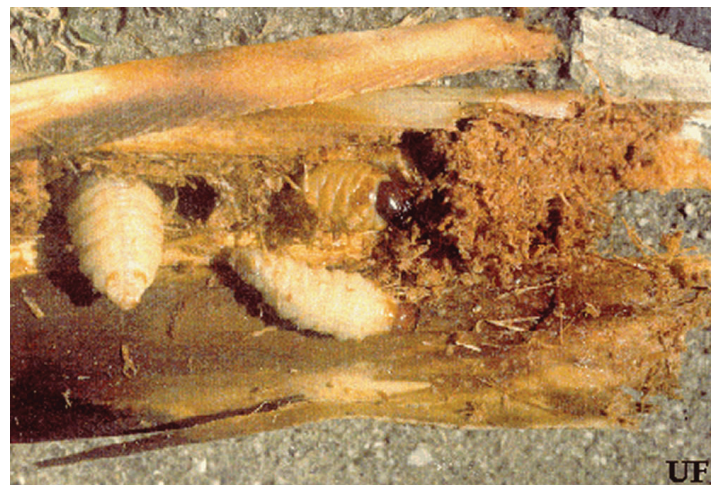
Figure 9. Palmetto weevil, Rhynchophorus cruentatus Fabricius, grubs feeding in palm crown.