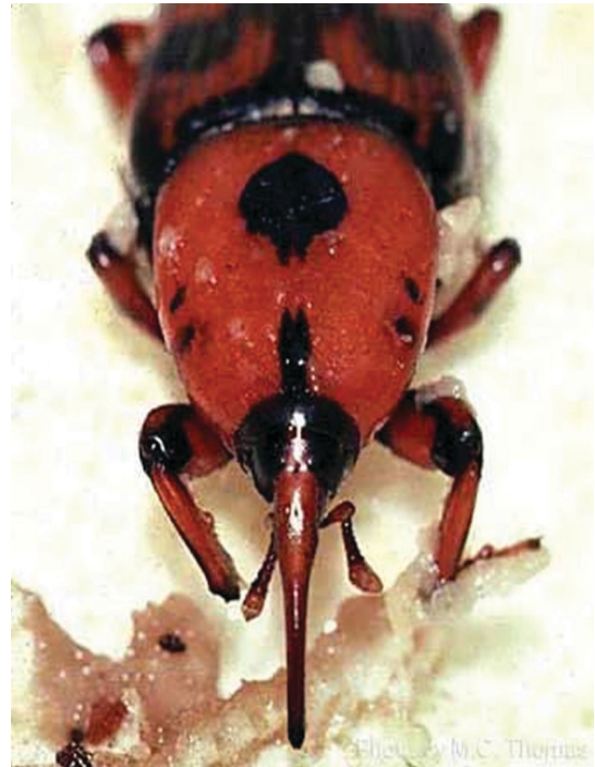
Figure 2. Head (and rostrum) of the palmetto weevil, Rhynchophorus cruentatus Fabricius.

Weevils are a family of beetle that have their mandibles at the end of a sometimes very long rostrum (a snout-like projection of the head). In fact, the rostrum of some weevils (i.e., nut weevils) is as long as their bodies. These modified mouthparts are used for feeding and to prepare holes in