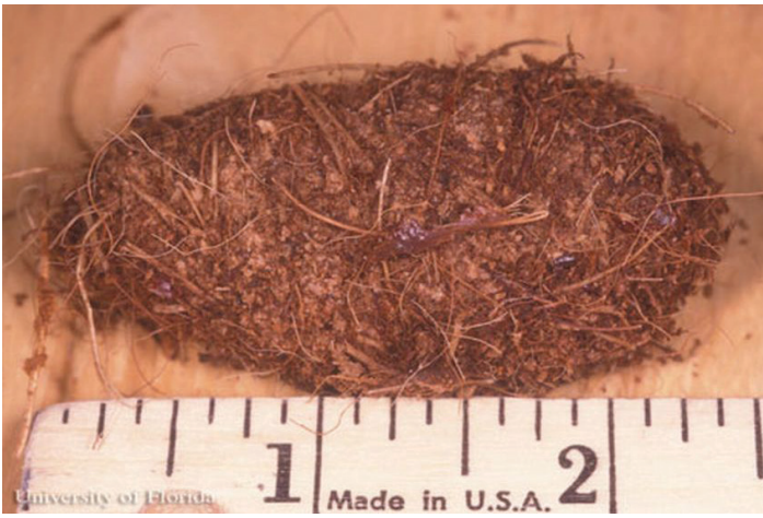
Figure 11. Pupal case of the palmetto weevil, Rhynchophorus cruentatus Fabricius.