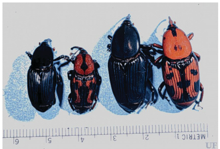
Figure 5. Adults of the palmetto weevil, Rhynchophorus cruentatus Fabricius, showing color variation.