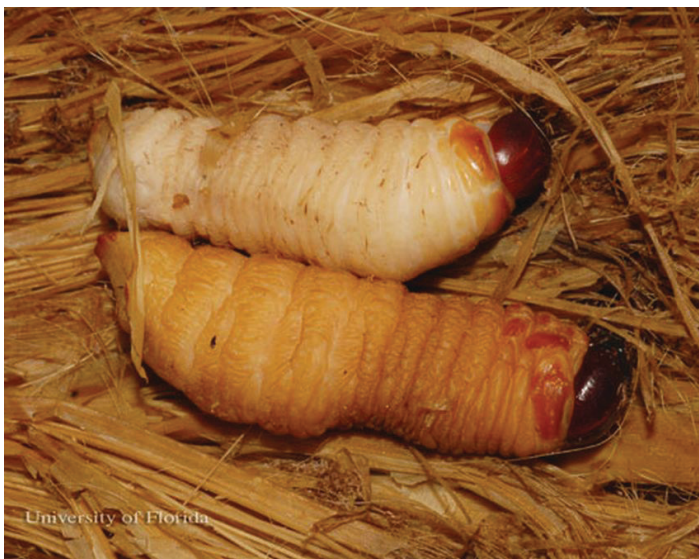
Figure 8. Palmetto weevil, Rhynchophorus cruentatus Fabricius, grubs in palm leaf base.

The larvae, or grubs, are legless and creamy to yellowish in color. Their prominent head is dark brown and very hard. They have large mandibles. Mature larvae can be quite large, some with a mass close to six grams. While we are aware of no human consumption of palmetto weevils in the United States, larvae of palm weevils are considered a delicacy in other areas.