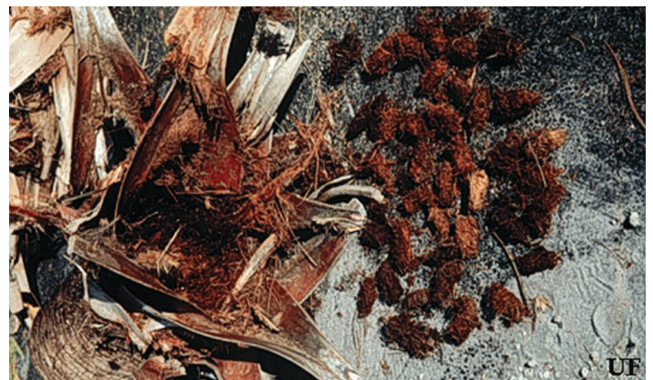
Figure 10. Cocoons (right) of the palmetto weevil, Rhynchophorus cruentatus Fabricius.