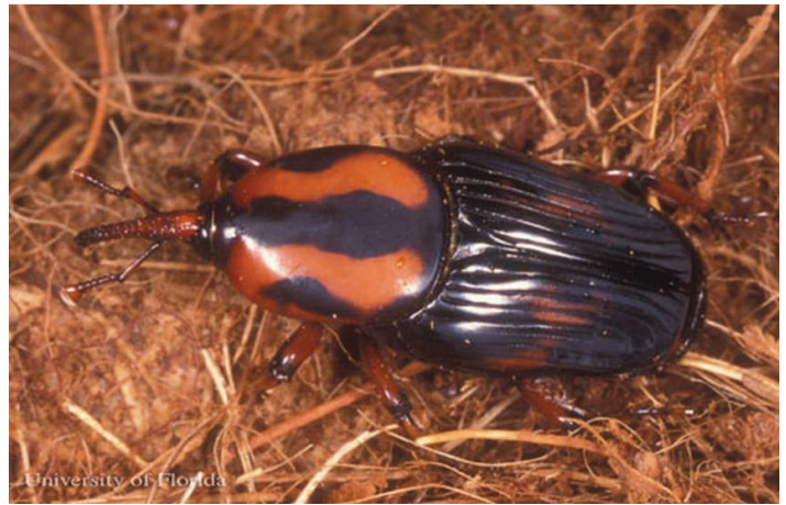
Figure 4. Dorsal view of the palmetto weevil, Rhynchophorus cruentatus Fabricius, with a variable black pattern.

Adult males and females can be distinguished by the surface of the rostrum. The rostrum of males are covered with tiny bumps while females have a smooth, shiny rostrum.