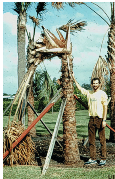
Figure 13. Sabal palm exhibiting “popped neck” condition due to damage by the palmetto weevil, Rhynchophorus cruentatus Fabricius.