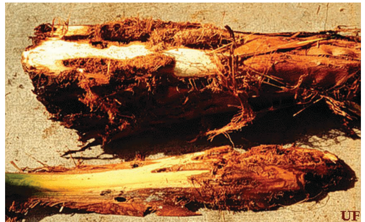
Figure 12. Damage to Canary Island date palm by larvae of the palmetto weevil, Rhynchophorus cruentatus Fabricius.

The symptoms of a palmetto infestation vary, but commonly involve a general, often irreversible decline of younger leaves. In palm species with upright leaves, such as the Canary Island date palm, the older leaves begin to droop during the early stages of infestation but quickly collapse thereafter. As the infestation progresses, the larval feeding damage and associated rot is so severe that the integrity of the crown is compromised and the top of the palm falls over. This condition is termed “popped neck.” If the palm is pulled apart at this stage, larvae, cocoons, and even adults may be found within the crown region. Early detection of weevil infestation is difficult, and treatment even in the early stages of infestation may be too late to save the tree depending upon the amount of damage to the apical meristem. This area needs more study, however.