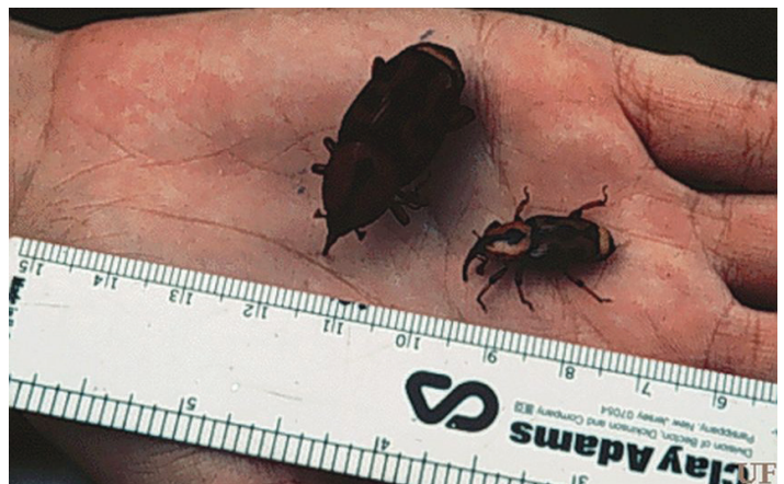
Figure 6. Adults of the palmetto weevil, Rhynchophorus cruentatus Fabricius, showing variable size.