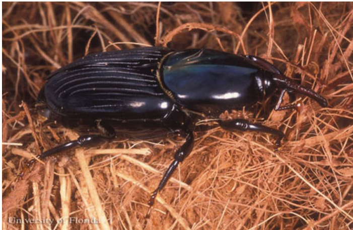
Figure 3. Lateral view of the palmetto weevil, Rhynchophorus cruentatus Fabricius, with a solid black color.

host plant material in which eggs are laid. Weevils are a large, diverse, and important group of insects. Most feed on plant material, and many are considered to be economic pests. While some adults feed outside the plant, the larvae (or grubs), which have relatively large mandibles and are legless, feed cryptically within the host plant.