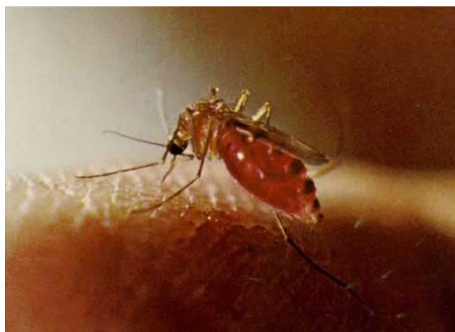
Figure 3. Adult female Florida SLE mosquito, Culex (Culex) nigripalpus Theobald, with blood meal.

Gravid Culex nigripalpus females take flight during evening crepuscular periods and search throughout the night for oviposition sites. Eggs of this species have been reported in virtually every type of aquatic habitat. However, the species is best