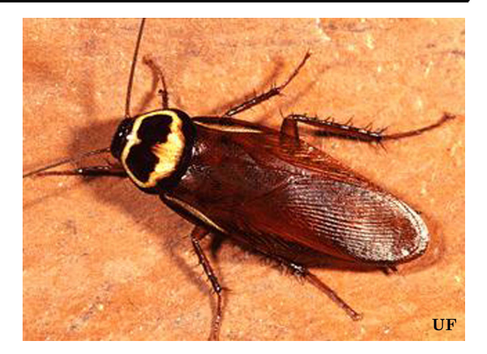
Figure 4. Australian cockroach (actual size 1 1/2").

surface by the female as soon as it is formed; however, the female German cockroach carries the