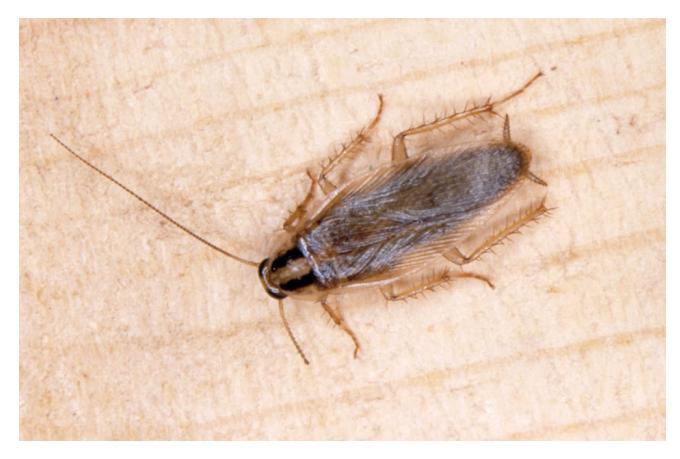
Figure 7. Asian cockroach (actual size 5/8").

the capsule of the German cockroach, but capsules of other cockroaches may have only 10-28 eggs.