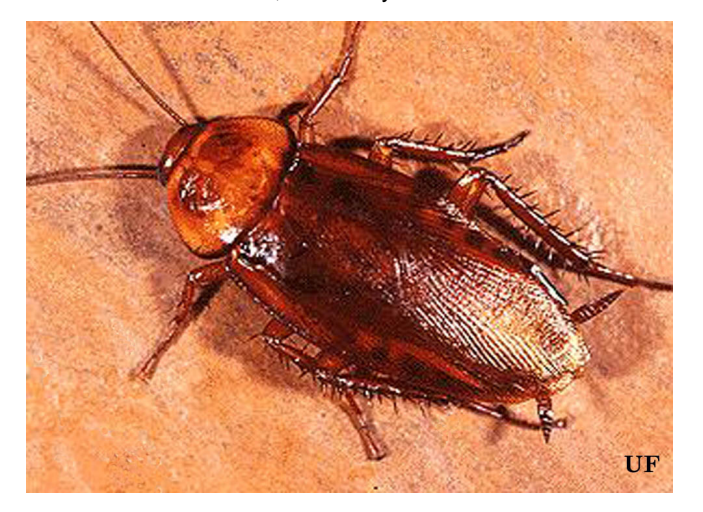
Figure 3. Brown cockroach (actual size, 1 1/2").

surface by the female as soon as it is formed; however, the female German cockroach carries the