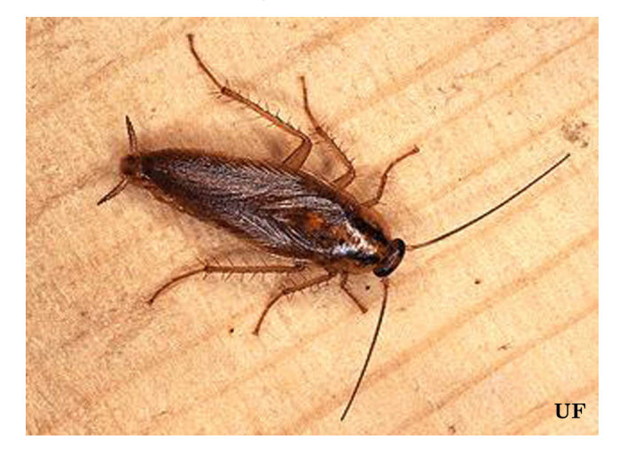
Figure 5. German cockroach (actual size 5/8").