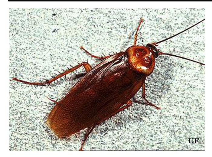
Figure 1. American cockroach (actual size, 1 1/2").