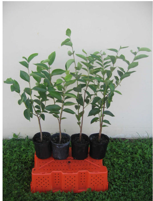
Figure 1. Pond apple seedlings.

Pond apple, a semi-deciduous, woody tree, is native to mainland Florida. The Institute of Regional Conservation lists this species as a native species in south Florida (Gann et al. 2016). The USDA map of pond apple locations shows that this species is distributed only in Florida and Puerto Rico ( http://plants.usda.gov/core/profile?symbol=ANGL4 ). The species can grow 10 feet or taller. The plant has