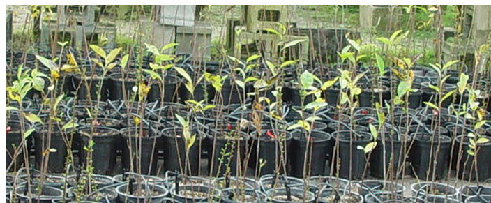
Figure 4. Pond apple seedlings suffering from iron deficiency.

Pond apple is very tolerant to brackish water conditions but sensitive to low-iron stress. When this species is grown in dry conditions, the leaves turn yellow easily and rapidly due to iron deficiency (Figure 4). Thus, this species needs to be grown in soil with appropriate moisture. If the leaves turn yellow, iron fertilization is needed. To avoid or correct iron deficiency of the species, please read these EDIS publications on iron: Iron Deficiency in Palms ( http://edis.ifas.ufl.edu/ep265 ), Iron (Fe) Nutrition in Plants ( http://edis.ifas.ufl.edu/ss555 ), Understanding and Applying Chelated Fertilizers Effectively Based on Soil pH ( http://edis.ifas.ufl.edu/hs1208 ) (Broschat 2011; Hochmuth 2014; Liu et al. 2015).