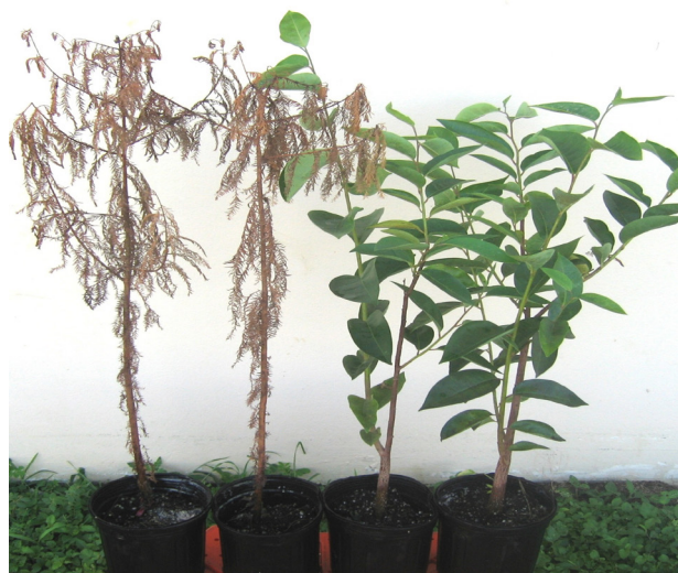
Figure 3. Bald cypress seedlings (left two plants) died of salt stress after roots were 100% submerged in brackish water with 15,000 ppm sodium chloride for 9 days, while pond apple seedlings (right two plants) grow well in the same growth condition.