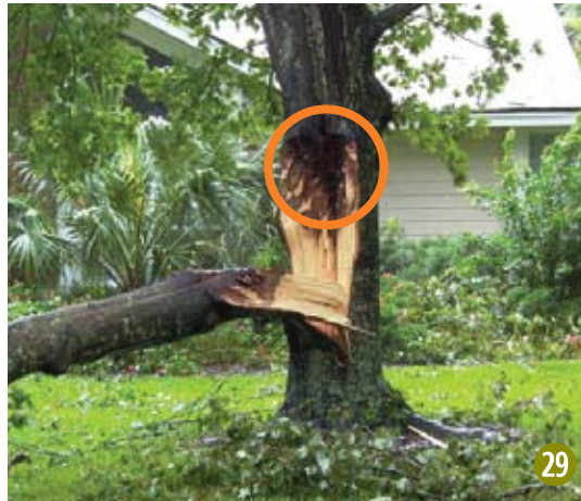
Figure 29 The circle shows a bark inclusion which broke during a tropical storm. The tree should be removed.

Figure 29 shows a tree that needs to be removed because of the large codominant stem that split from the trunk. Notice the dark area at the top of the split—it is a bark inclusion (Figure 29). Bark inclusions are weak unions between branches and are very susceptible to breakage.