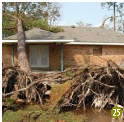
Figure 25 The high water table at this site restricted root depth and saturated soil allowed roots to slide in the soil, making these pines topple over during a hurricane.

Soil compaction, shallow soils, hardpans and a high water table restrict roots to shallow depths and can result in unstable trees (Figure 25).