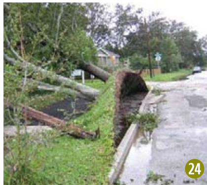
Figure 24 These roots were deflected by the curb and the compacted soil, making them very susceptible to blowing over in the direction away from the curb.

Trees with root systems confined to relatively small soil spaces are not as stable as trees allowed to develop more extensive root systems (Figure 24).