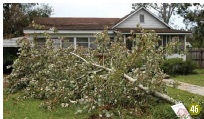
Figure 46 Recently planted trees, such as this red maple, should be treated as a new planting by staking and watering properly.