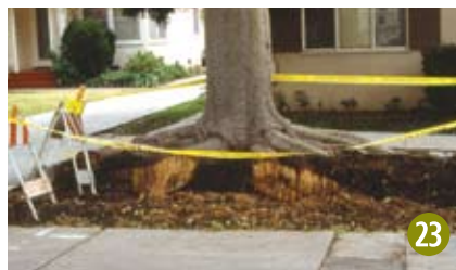
Figure 23 Construction is especially damaging to roots, such as these roots cut during curb repair.

The importance of root integrity and health cannot be overemphasized. In addition to absorbing water and essential elements, roots anchor the tree. If roots are damaged in any way, the likelihood of failure increases (Figure 23). Construction activities within about 20 feet of the trunks of existing trees can cause the trees to blow over more than a decade later.