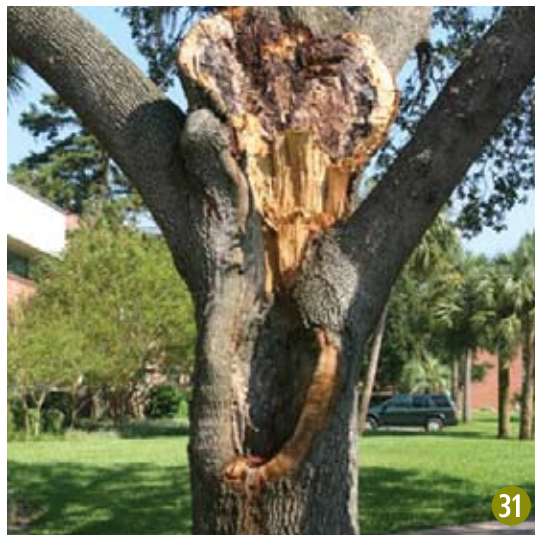
Figure 31 One split occurred 8 years ago (lower injury) and one occurred about 2 weeks before this photo was taken. The tree should be removed.

The tree shown in Figure 31 should be removed! It suffered major structural damage and the remaining tree structure is compromised. All the mass is on one side of the tree, and the trunk is very weak because of the two splits. The cause of both splits was a bark inclusion.