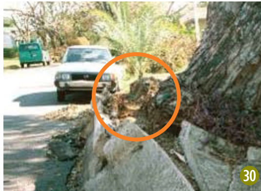
Figure 30 This leaning tree needs to be removed since major structural roots were broken and lifted.

If a leaning tree is likely to fall on a person, building, power line, roadway or other valuable target, it should be removed immediately after the storm. However, all leaning trees should have their roots carefully examined for breakage, exposure or lifting out of the soil (Figure 30). Pay close attention to leaning trees with unbalanced canopies, cracks in the trunk and bark inclusions.