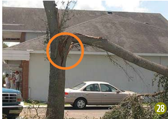
Figure 28 This tree should be removed since its broken stem is very large and the trunk is cracked, as shown by the circle. If the tree were not cracked into the trunk, the broken limb could be carefully removed and the tree might be restorable.

Trees with cracks in the main trunk and branches are very dangerous, since limbs with this type of damage are not well-secured to the tree. Cracks well into the trunk (Figure 28) will not close and represent a severe defect that makes such trees a high risk in the landscape.