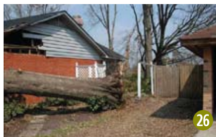
Figure 26 These white oak roots were confined by the buildings around them, probably damaged by construction and compaction, resulting in a root system too small to support such a large tree canopy.

The importance of selecting the right tree for the right location has been greatly stressed, and yet selection of inappropriate trees is one of the most common mistakes observed. For example, the white oak ( Quercus alba ) in Figure 26, which can grow to 100 feet and will develop wide-spreading crowns and numerous horizontal branches.