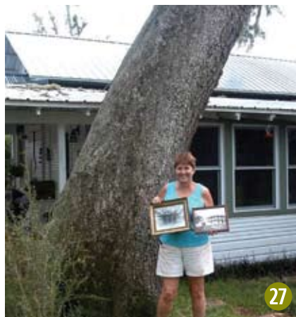
Figure 27 This live oak is part of a historical 1900s hotel, as shown by the owner, located in the Bagdad Village Historic District, Milton, FL.

In addition to the economical value and ecological services that trees provide to the owner and community, the tree in question might be a memorial tree, or it may have a historical significance or some other cultural attribute associated with it (Figure 27).