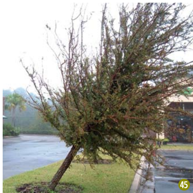
Figure 45 This leaning elm ( Ulmus spp. ) could be stood up and staked.