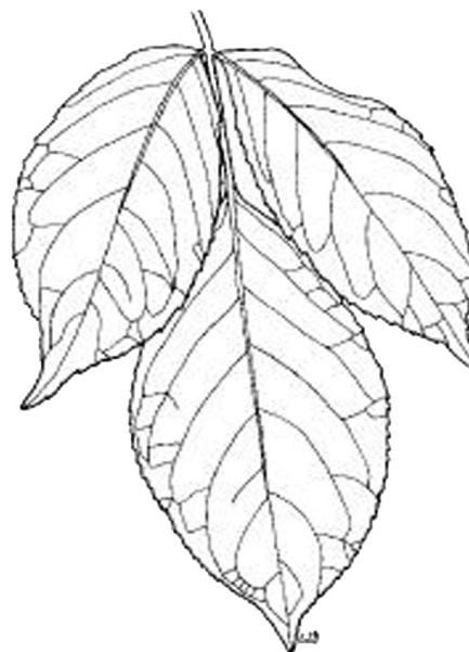
Figure 3. Foliage of balfour aralia