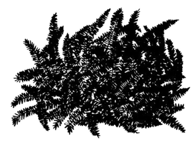
Figure 1. Boston fern