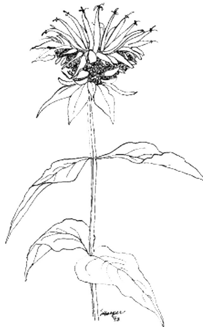
Figure 1. Bee balm