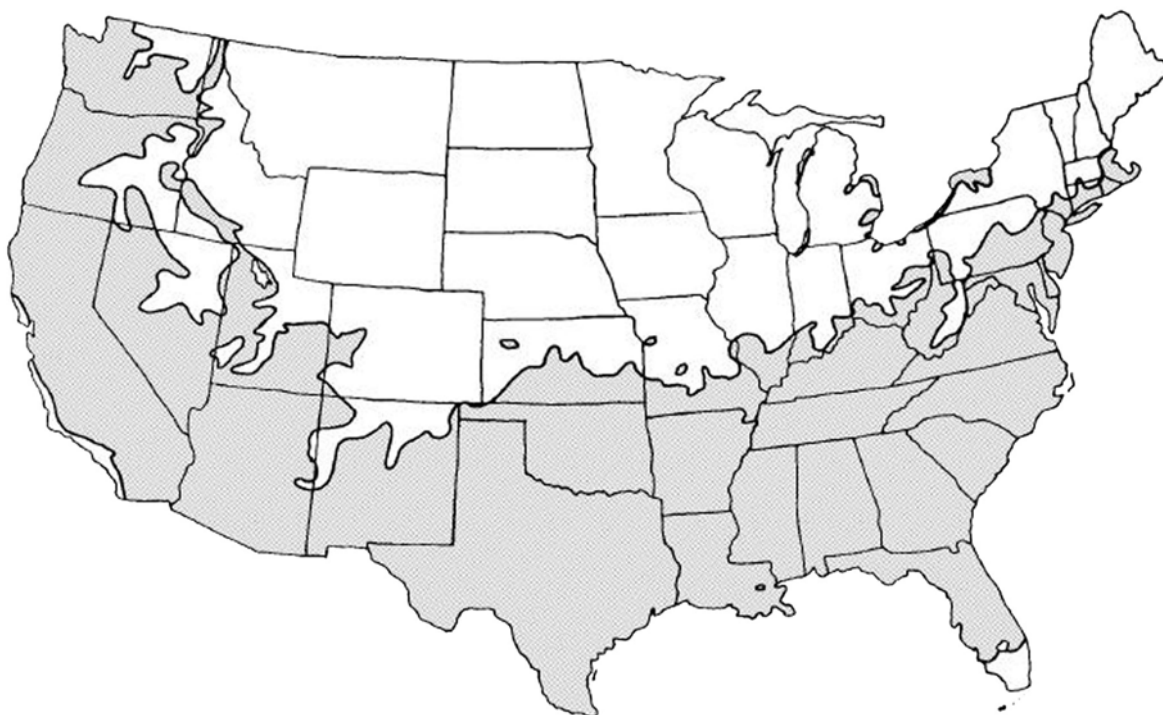
Figure 2. Shaded area represents potential planting range.