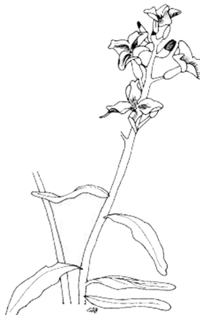
Figure 1. Stock

Planting month for zone 9: Apr; May; Nov; Dec