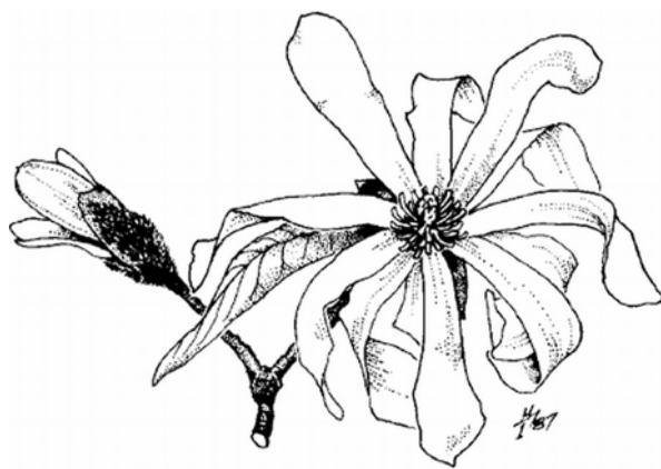
Figure 3. Flower of 'Royal Star' star magnolia