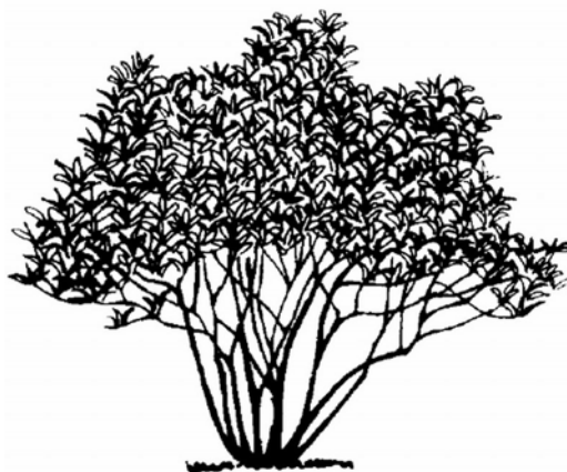
Figure 1. 'Centennial' star magnolia

Scientific name: Magnolia kobus var. stellata 'Centennial'