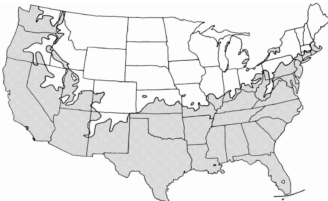
Figure 2. Shaded area represents potential planting range.