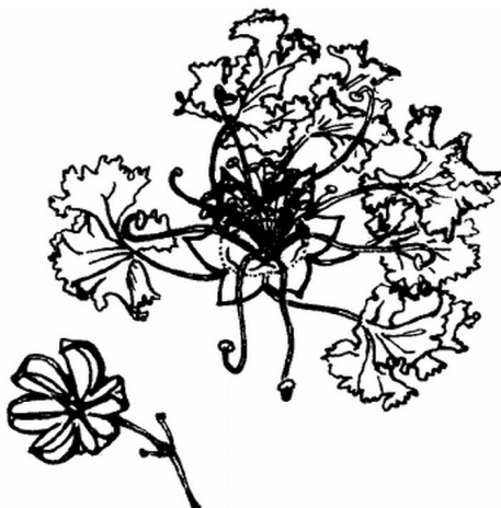
Figure 3. Flower of 'Apalachee' crape myrtle

Trunk/bark/branches: showy; no thorns; can be trained to grow with a short, single trunk