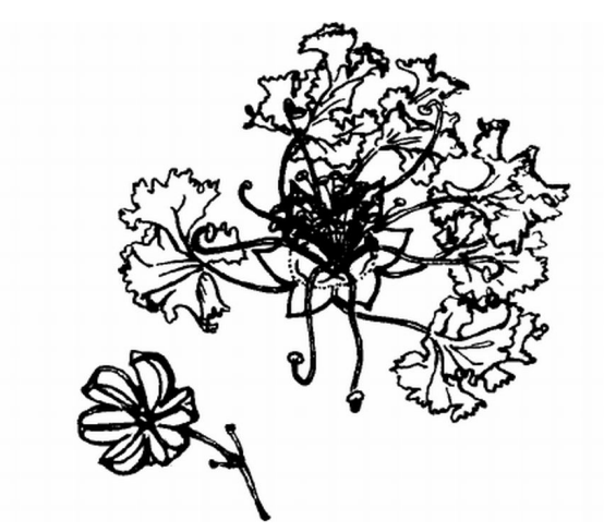
Figure 3. Flower of 'Yuma' crape myrtle

Trunk/bark/branches: showy; no thorns; can be trained to grow with a short, single trunk