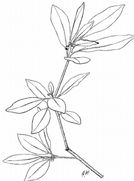
Figure 1. Anise