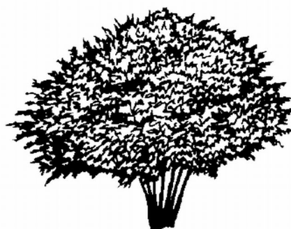
Figure 1. 'Hunter' Possumhaw.

This native North American tree is often seen as a spreading 8 to 10-foot-high shrub but can also become a 20-foot-tall tree when planted in partial shade (Fig. 1). Although the two to three-inch-long, dark green leaves are deciduous they do not present any appreciable fall color change. From March to May, small white flowers appear among the leaves. These blooms are followed by the production of small fruits which become orange/red when they ripen in early autumn. Since male trees will not fruit, be sure to purchase females so you will not miss the abundant fruit production. These fruits persist on the tree throughout the winter and are quite showy against the bare branches. After the fruits have been exposed to freezing and thawing, they become a favorite food source of many birds and mammals.