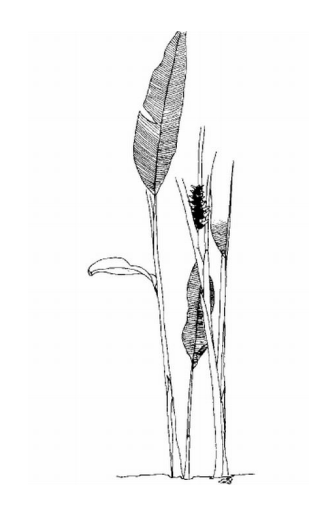
Figure 1. Caribbean Heliconia.

USDA hardiness zones: 10B through 11 (Fig. 2)