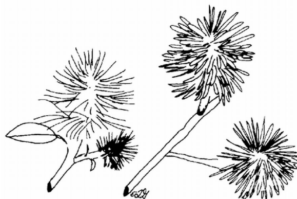
Figure 1. Large Fothergilla

Planting month for zone 10 and 11: year round