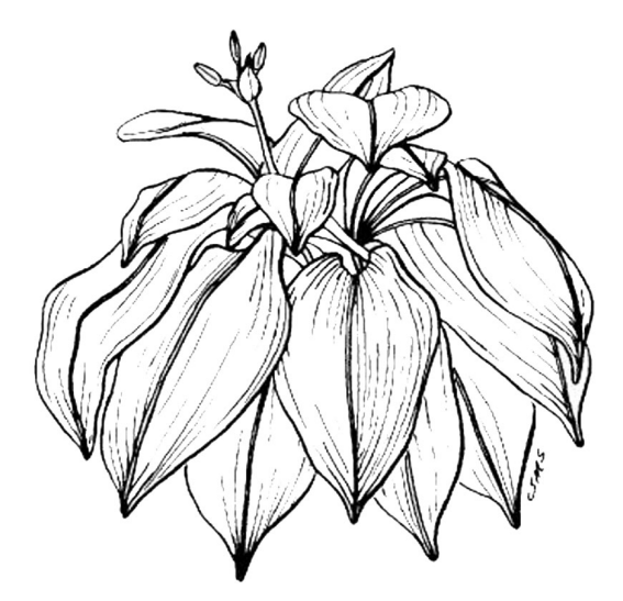
Figure 1. Amazon lily