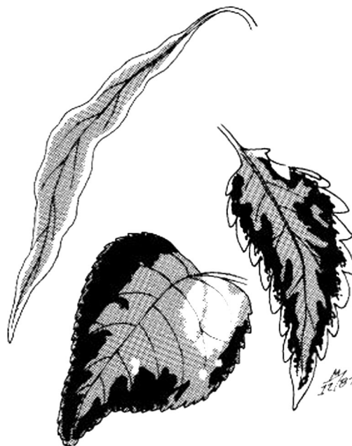
Figure 1. Coleus.