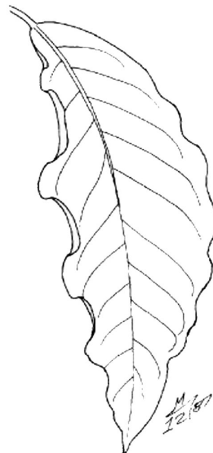
Figure 1. Coffee.

Uses: fruit; specimen; container or above-ground planter; hedge; near a deck or patio; espalier; border