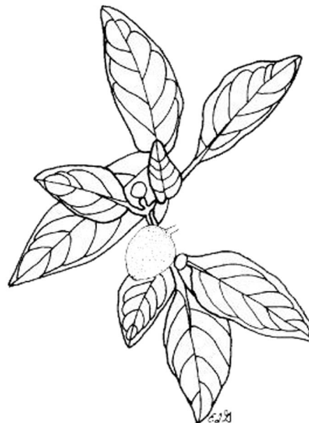
Figure 1. Ornamental Pepper.

Common name(s): Ornamental Pepper, Bush Red Pepper