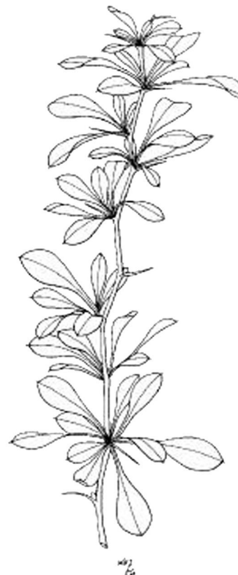
Figure 1. Japanese Bayberry.

USDA hardiness zones: 4 through 9 (Fig. 2)