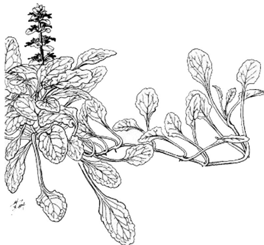
Figure 1. Bugleweed.

This ground-hugging groundcover produces a profusion of dark green to bronze- or purple-colored leaves in a flat rosette, spreading fairly quickly by runners or stolons (Figure 1). Plant on 6 to 12-inch centers for quick establishment of a thick ground cover. Six-inch tall spikes of small blue flowers are produced in spring to early summer and are especially attractive when plants are massed together. There are selections with foliage variegated in green, white, red, yellow, and pink.