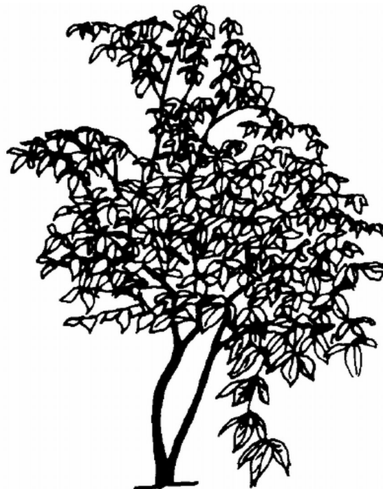
Figure 1. Bottlebrush buckeye

USDA hardiness zones: 5 through 9A (Fig. 2)