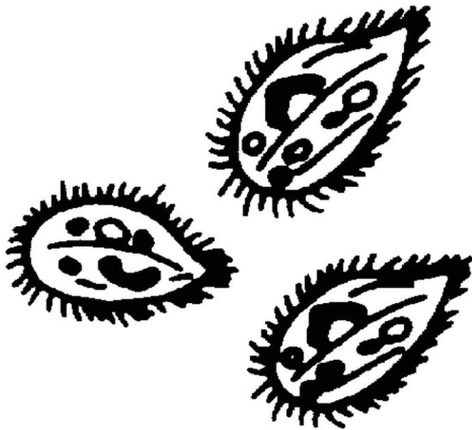
Figure 3. “Ich” theronts—infective stage looking for fish host.

observation of a single “Ich” parasite is sufficient to make treatment necessary.